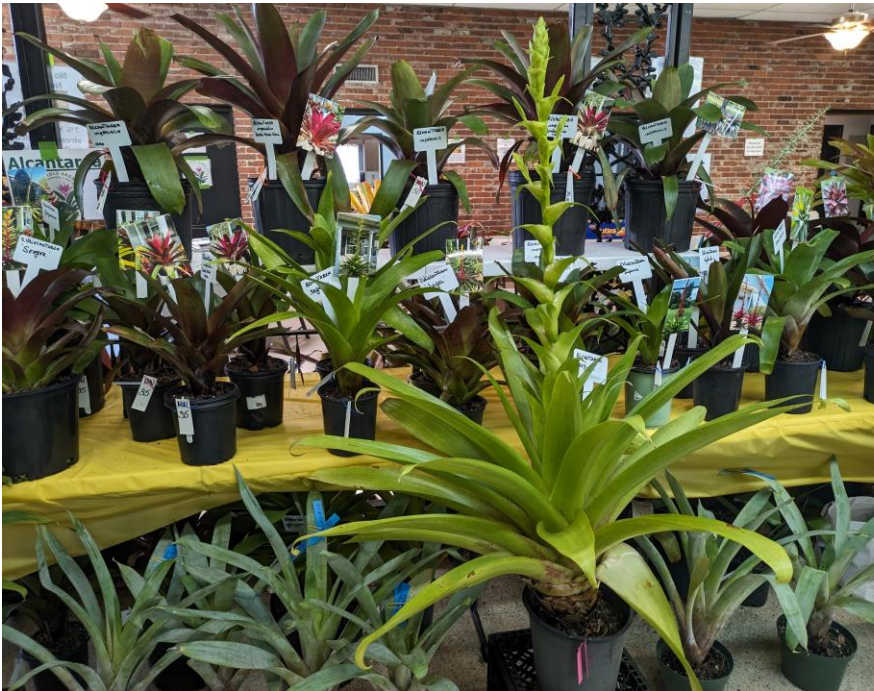
Alcantareas and more at the 2024 Annual Spring Plant Sale