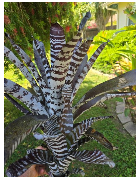
4/21/24 Plant Picture of the Day: Aechmea chantinii (spineless) by John Boardman