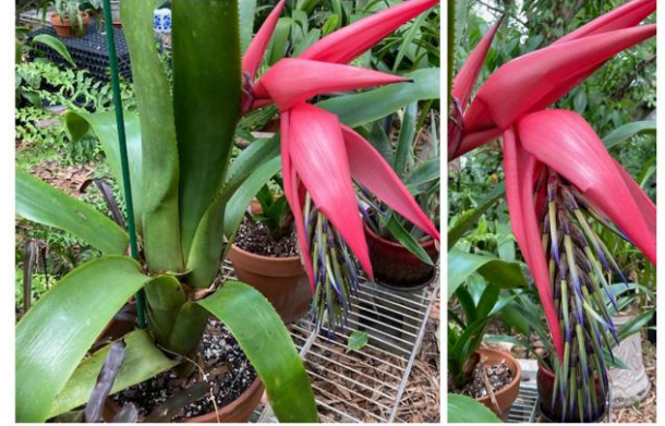
4/26/24 Plant Picture of the Day: Billbergia alfonso-joannis