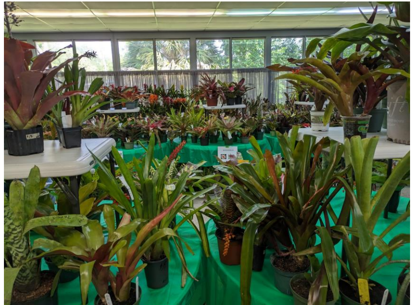
Plants at the 2024 Annual Spring Plant Sale

Dave launched Bromeliads Galore as a collector's nursery in 1990. He had over 2,000 different species and hybrids, but has since cut back to only over 1,000 different Bromeliads!