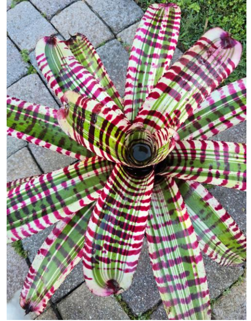
4/16/25 Plant Picture of the Day: Neoregelia 'Bulletproof' (Skotak) by John Boardman

The SBTPS will host the 2025 Bromeliad Extravaganza on September 26-27, 2025 at the Ramada Gateway hotel in Kissimmee. The hotel rate is only $85.80 plus tax with free parking. It is recommended that you book the hotel as soon as possible. The registration fee of $125 includes two dinners, early admission to the biggest Bromeliad sale of the year in Florida and admission to three seminars. See BromeliadX.com for more information.