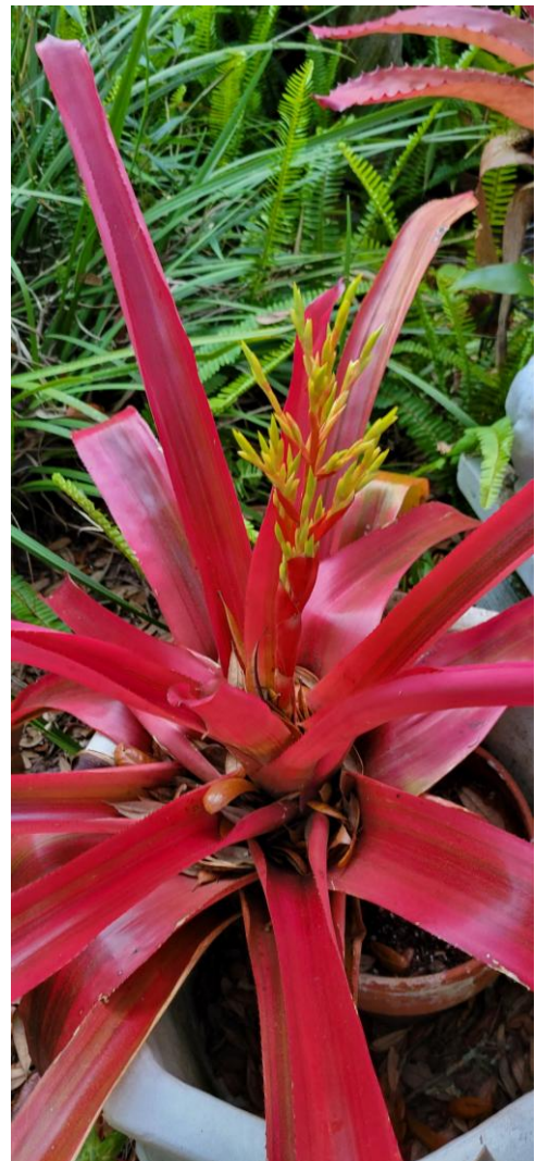
4/28/25 Plant Picture of the Day: Aechmea 'Sudi' by Jacquie Petrovich