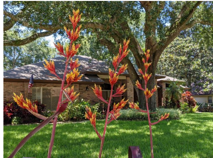
8/12/23 Plant Picture of the Day: Aechmea 'Pinot Noir'