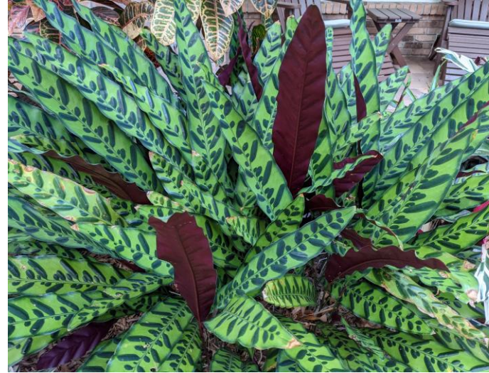
8/28/23 Plant Picture of the Day: Rattlesnake Plant ( Calathea lancifolia )

October 15 th Meeting: Terrie Bert Growing Beautiful Bromeliads in Central Florida