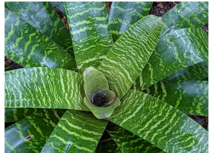
9/2/23 Plant Picture of the Day: Vriesea hieroglyphica x fosteriana