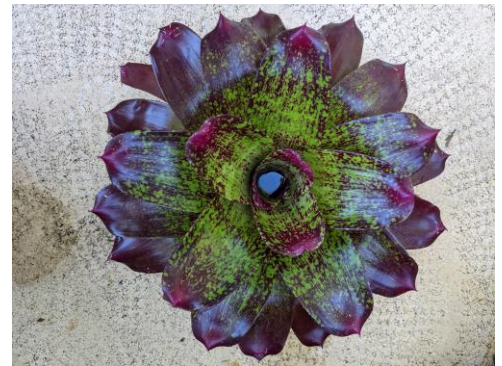
5/5/23 Plant Picture of the Day: Neoregelia 'Gypsy Rose' (Leo Castro)