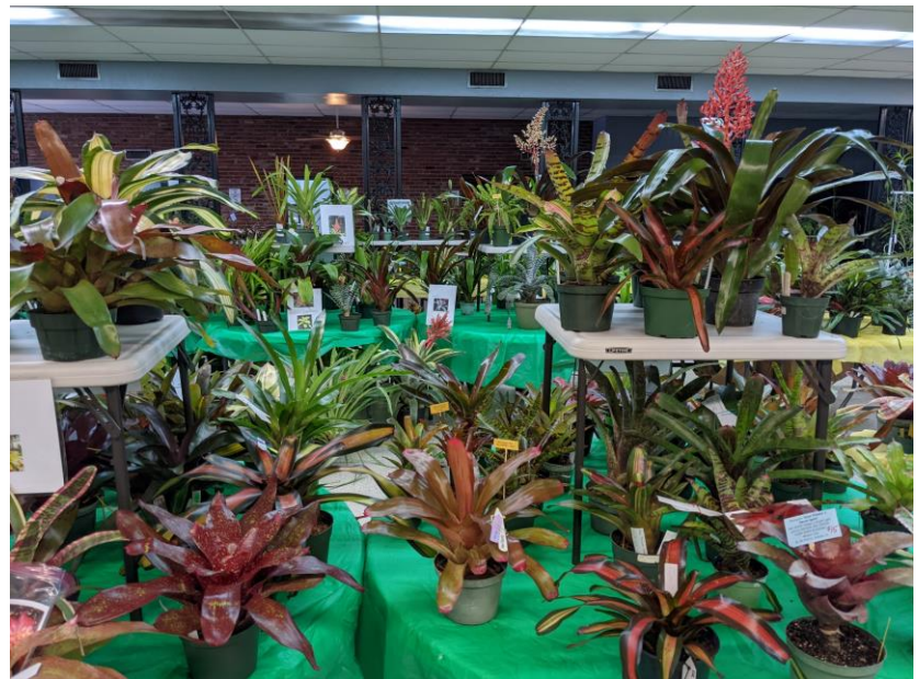
Plants at the August Plant Sale