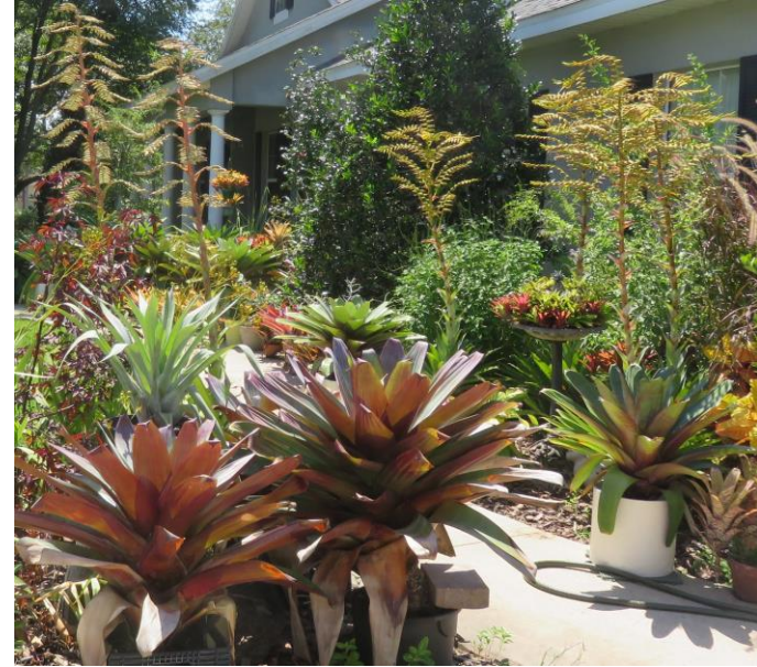
8/19/22 Plant Picture of the Day: Alcantareas glaziouana & heloisae (on top) xVriecantarea 'Julietta' (in pots on bottom left)