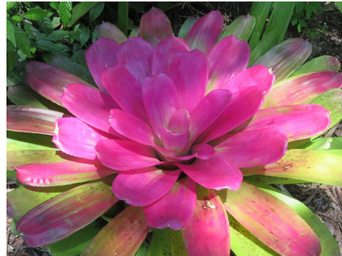
8/18/22 Plant Picture of the Day: Neoregelia 'Groves Passion'