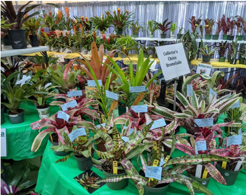
Some of the many plants at the Annual Fall Plant Sale

Our 2 nd Annual Sanford Garden Club Plant Sale featuring commercial vendors will be held on Oct. 15 th from 9 to 5. A native plant sale will also be held outside.