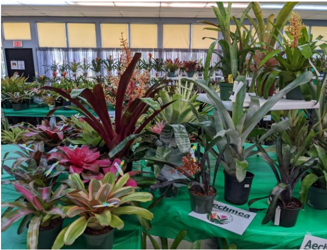
Plants at the 2023 Fall Plant Sale

The SBTPS plant sale features a large selection of Bromeliads, Gingers, Orchids, and many other tropical plants.