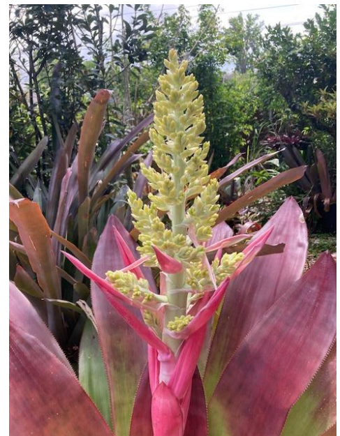
3/30/24 Plant Picture of the Day: xAndrolaechmea 'Dean' (by Cathy Schubert)

How do we pick the Plant Pictures of the Day to include in this newsletter? We select the ones that receive the most interest (with the highest number of Likes) on the Facebook page .