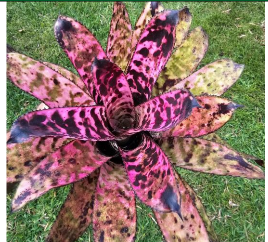
4/2/24 Plant Picture of the Day: Aechmea orlandiana 'Pink'