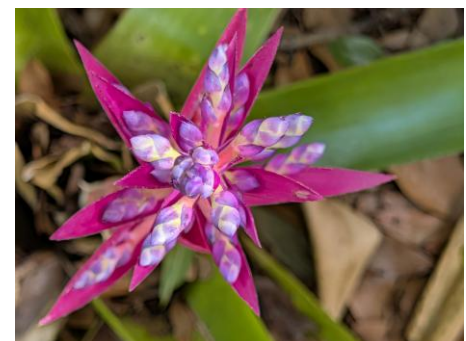
4/5/26 Plant Picture of the Day: Aechmea 'Lillian' by Greg Kolojeski