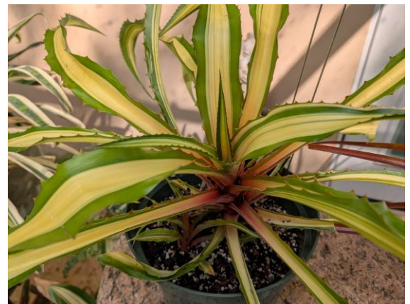
3/27/26 Plant Picture of the Day: Aechmea magdalenae 'Quadricolor' by Greg K.