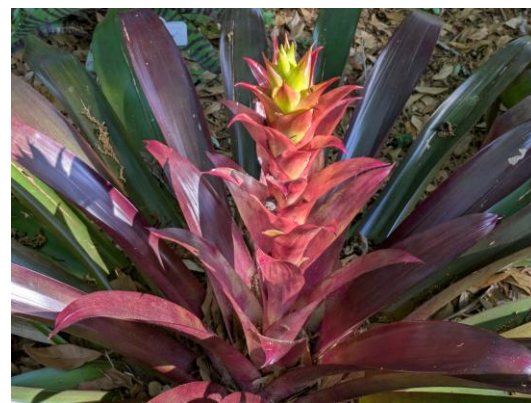
3/18/25 Plant Picture of the Day: xVriecantarea 'Seeger'