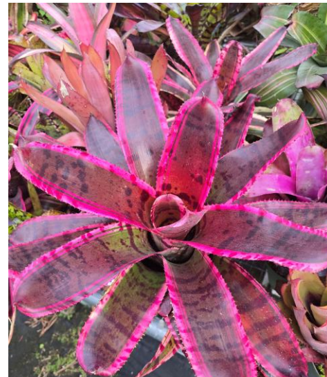
4/2/25 Plant Picture of the Day: Neoregelia 'Band Tastic' (Skotak) by John Boardman