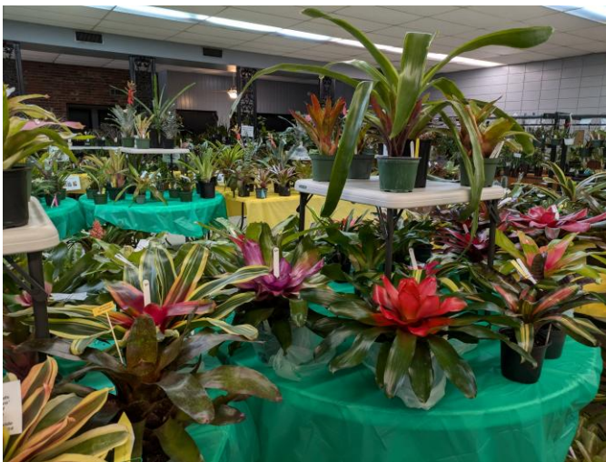
Plants at the 2024 Fall Plant Sale

The SBTPS plant sale features a large selection of Bromeliads, Orchids, Gingers and many other tropical plants.