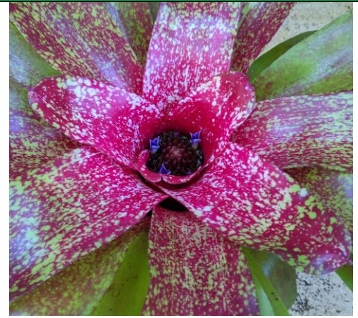
6/8/23 Plant Picture of the Day: Neoregelia 'Fruity Pebbles' (Leo Castro)

Annual Fall Plant Sale: August 19-20, 2023: 9-4 PM each day