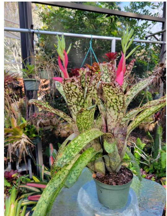
1/29/24 Plant Picture of the Day: Billbergia 'Arribella'