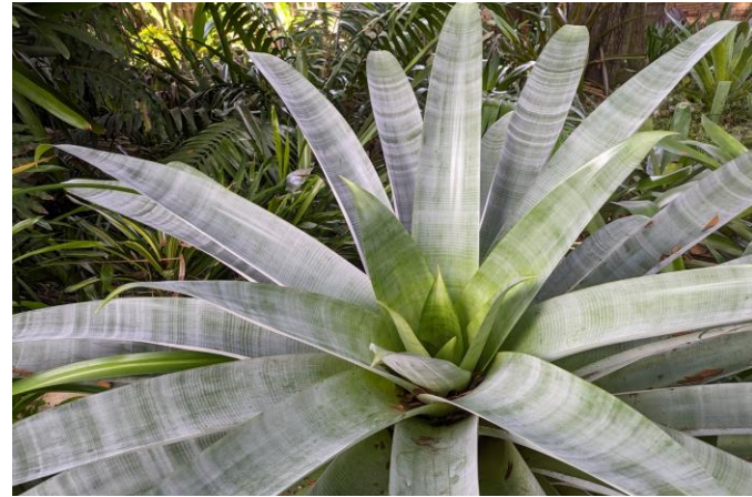
1/19/24 Plant Picture of the Day: Alcantarea brasiliana