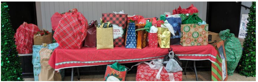
Plant Presents at the 2023 Holiday Party