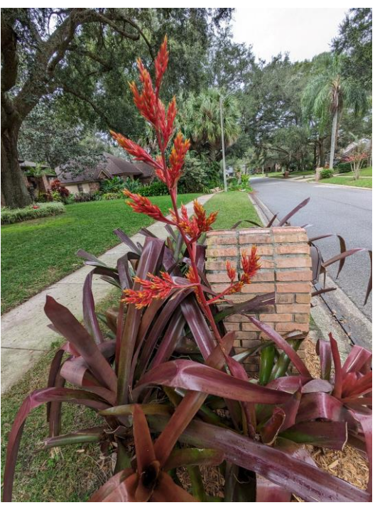
12/26/23 <u>Plant Picture of the Day</u>: Aechmea 'Pinot Noir'

February 18<sup>th</sup> Meeting: Tour of McCrory's Bromeliads