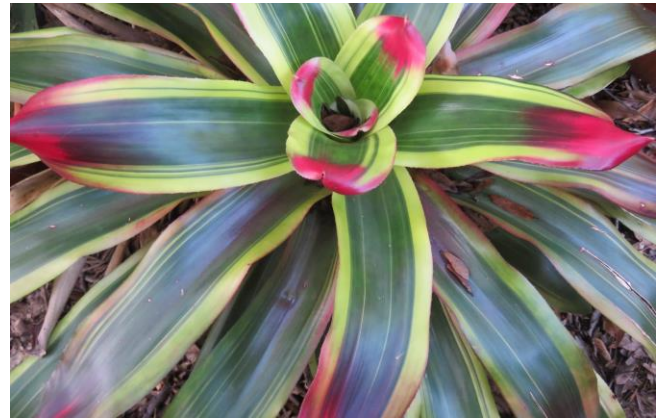
1/6/24 Plant Picture of the Day: Neoregelia 'Grant's Serendipity'