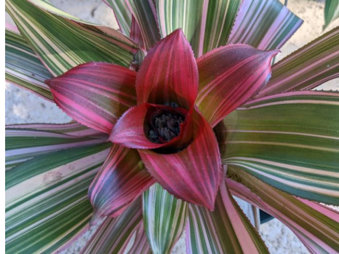
10/15/23 Plant Picture of the Day: Nidularium 'Mayhem'

SBTPS Bromeliad Plant Sale at Nehrling Gardens: Saturday, December 9, 2023, 9 AM to 3 PM