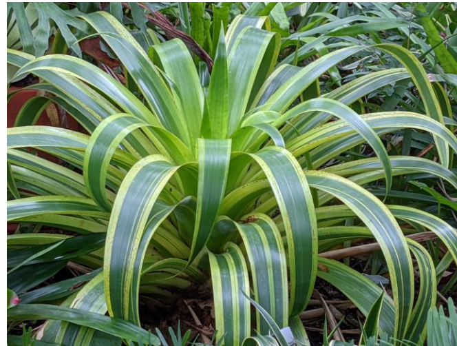
10/12/23 Plant Picture of the Day: Alcantarea 'Aurora'