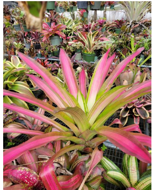
11/7/23 Plant Picture of the Day: Androlepis 'Party Dress' by John Boardman