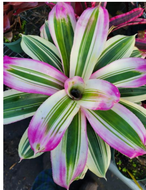
1/26/23 Plant Picture of the Day: Neoregelia 'Shebang Bang'