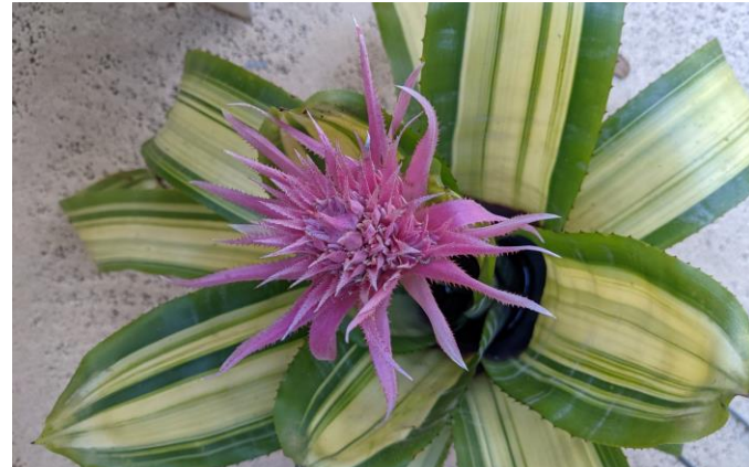
1/18/23 Plant Picture of the Day: Aechmea 'Supernova'