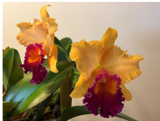
1/5/23 Plant Picture of the Day: Cattleya Orchid Hagan's Ace 'Mandarin Orange'