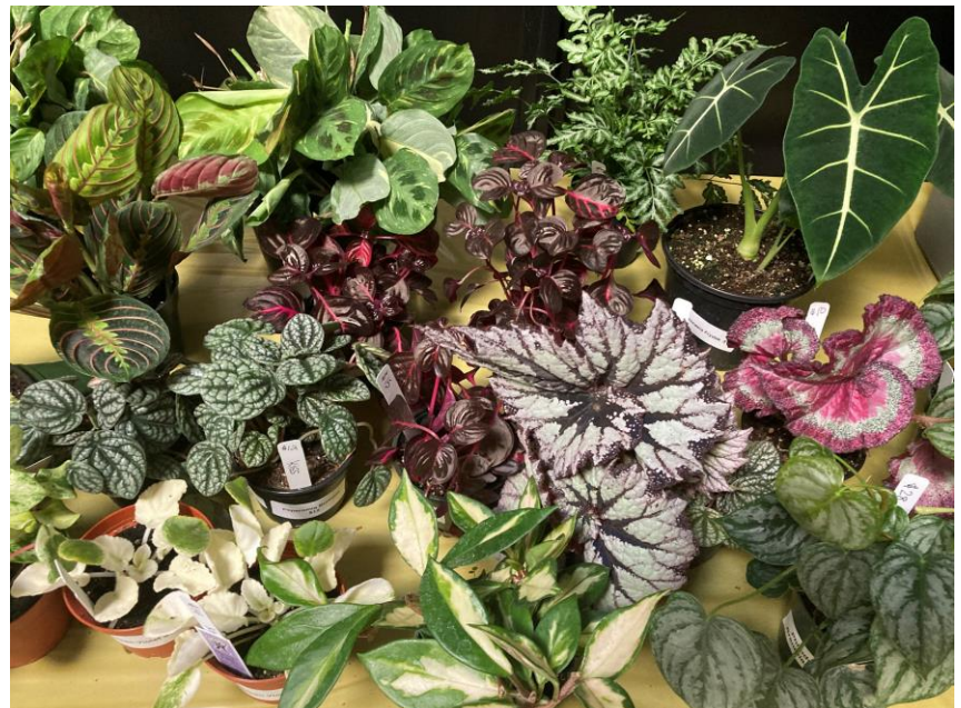
Plants at the 2023 Annual Spring Plant Sale