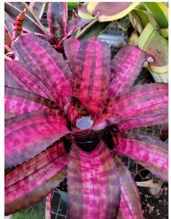
4/28/23 Plant Picture of the Day: Neoregelia 'Legend' by John Boardman