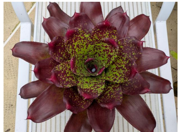
2/21/25 Plant Picture of the Day: Neoregelia 'Emerald City'