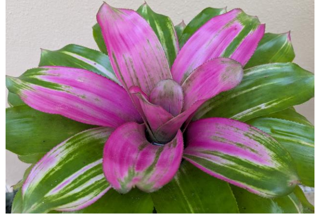
2/22/25 Plant Picture of the Day: Neoregelia 'Donna' (Grant Groves)

2025 Membership Dues are $15 for an individual or $20 for a dual membership. You may renew your membership online at https://sbtps.square.site/ . An email notice was sent out on March 5 th to those who have not yet renewed.