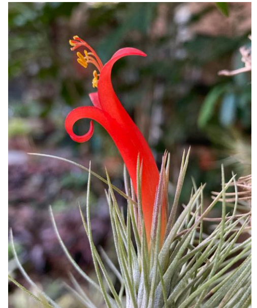
7/1/22 Plant Picture of the Day: Tillandsia funkiana by Cathy Schubert