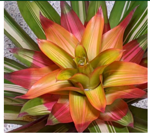
6/20/22 Plant Picture of the Day: Guzmania 'Tutti-Frutti' variegated

Annual Fall Plant Sale: August 20-21, 2022: 9-4 PM each day