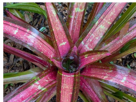
5/20/26 Plant Picture of the Day: Neoregelia 'Artic Monkey' (Mellica) by Greg K.