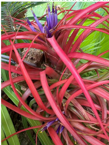
5/30/26 Plant Picture of the Day: Tillandsia red abdita by Sandi Wirth

July 19 th Meeting: David Sand A Bromeliad Topic and Pineapple Day!