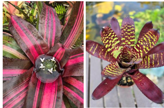
5/27/26 & 6/1/26 Plant Picture of the Day: Neoregelia 'Hot Cargo' (Skotak) and Neoregelia 'Sunfire Pheasant' (Devonshire) by John Boardman